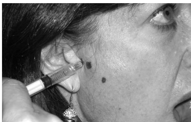
Figure 8. Angle and depth for injection of posterior joint space with a one-inch needle, behind the translated condyle and into the depth of the fossa.

The second target is the anterior disc attachment, where the disc connects to the superior portion of the lateral pterygoid muscle. This muscle often is foreshortened or in spasm in cases of chronic disc displacement. Injecting the Prolotherapy solution here can strengthen the tendinous attachment of this muscle to the disc at the same time the anesthetic component anesthetizes and elongates the muscle, which can allow the disc to reposition itself over the condyle and often produces an immediate reduction in TMJ clicking. We locate this target area at the same time we palpate the location of the posterior joint space, note the location of the slight depression just anterior to the condyle when the mouth is closed, and mark this point with washable ink. Marking this point before injecting the posterior aspect of the joint is advisable, as it becomes much more difficult to palpate this depression after the posterior joint recess has been injected. For this injection, the bite block is removed and the patient is instructed to