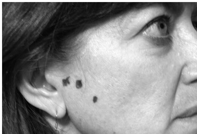
Figure 7. Marked injection sites.