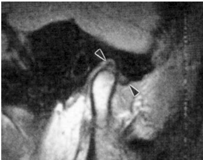
Figure 2. This MRI reveals normal “bow tie” disc anatomy and placement from the twelve o’clock to three o’clock position (between arrows), anterosuperior to the condyle.

After an unpredictable period of jaw clicking on opening, the ligaments may become so injured and lax that the disc remains out of place, obstructing the condyle and limiting jaw movement. This joint condition is commonly referred to as “closed lock.” The joint becomes quieter