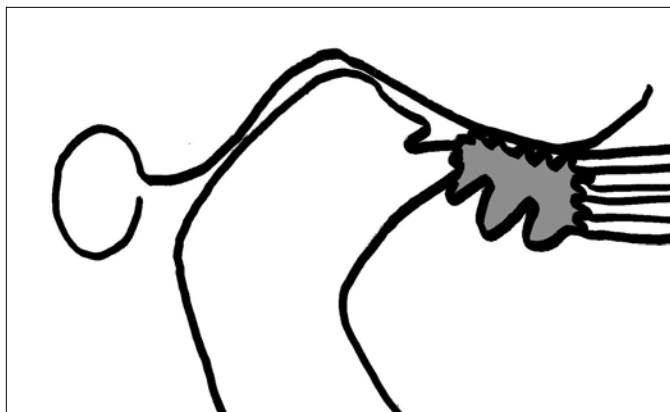
Figure 5. The condyle has perforated the retrodiscal tissues and begun to place pathologic pressure on the tissues between the condyle and the ear, often producing various types of otalgia and/or tinnitus. The disc and anterior surface of the condyle have undergone severe degenerative change.

achieved overnight, leaving the appliance out during the day allows joint misalignment during waking hours and the degenerative process within the joint may continue. Furthermore, bulky appliances may intrude on tongue space and compromise both comfort and breathing, and rubbery appliances often encourage bruxism, which can aggravate the myogenous pain of the disorder. 9