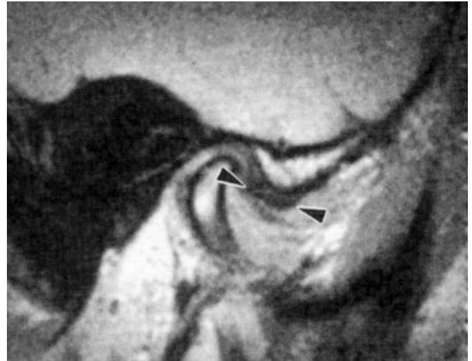
Figure 3. This MRI shows a distorted disc (between arrows) that is displaced anteriorly and inferiorly to the condyle. Reciprocally, the condyle is displaced posteriorly into the retrodiscal tissues adjacent to the external auditory meatus.